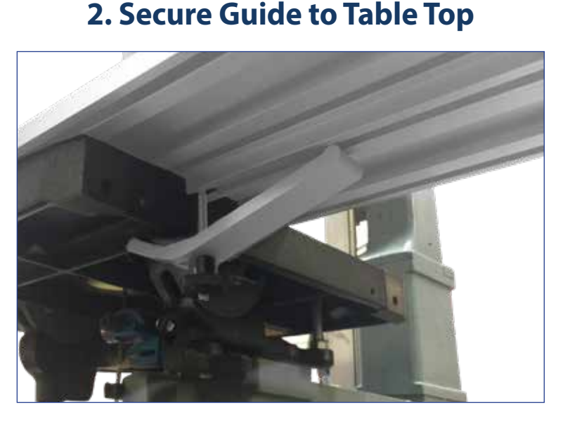
Using the two aluminum hold downs (1 on each side of the table), secure the Super Wide Miter Guide to your band saw table top as shown above.

Place each leg toward the outer edge of each end of the Super Wide Miter Guide for optimum support. Secure each leg using the supplied T-bolts and Knobs as shown above. Once the legs are secure, adjust the legs and feet so that the feet sit firmly on the floor.