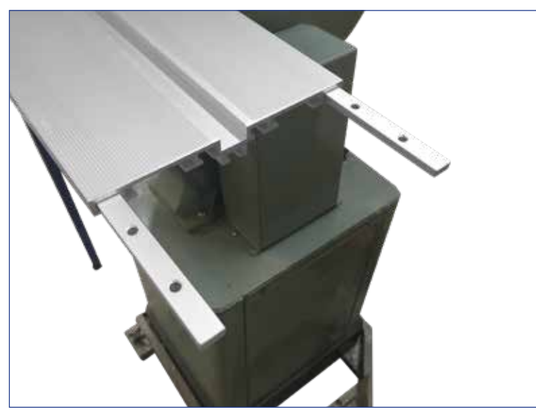
Slide the two bars into the tracks under the Super Wide Miter Guide that is on the band saw table. Leave about half of the bars out from the edge of the guide. Secure the bars using the set screws and a hex key wrench.